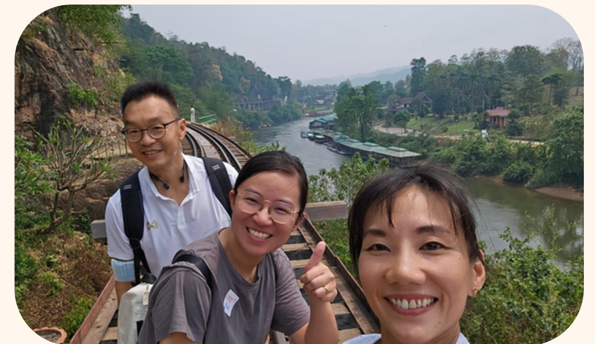
Kanchanaburi Death Railway